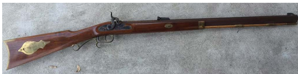
50 Cal. Black Powder Rifle (assembled from kit)

Tickets are $5 each or 5 for $20. Ticket purchases are not tax-deductible.