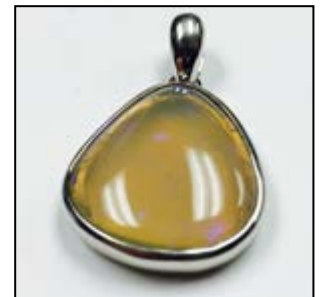
Sterling Silver and Opal Pendant Value: $440