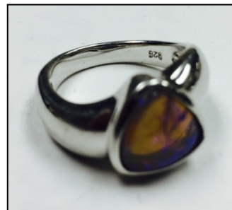
Sterling Silver and Opal Ring Value: $400