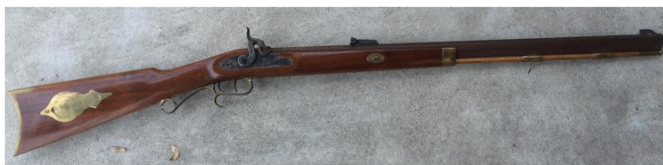
50 Cal. Black Powder Rifle (assembled from kit)

Tickets are $5 each or 5 for $20. Ticket purchases are not tax-deductible.