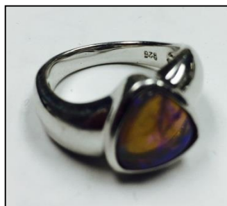
Sterling Silver and Opal Ring Value: $400