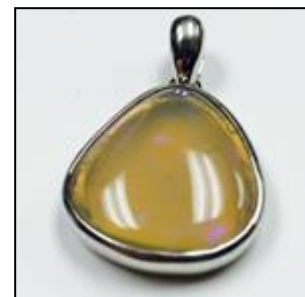
Sterling Silver and Opal Pendant Value: $440