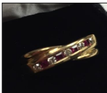
Diamond and Ruby 14kt Gold Ring Value: $450