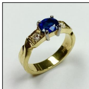
Sapphire and Diamond 18kt Gold Ring Value: $595

The items included in the 2015 Raffle are: